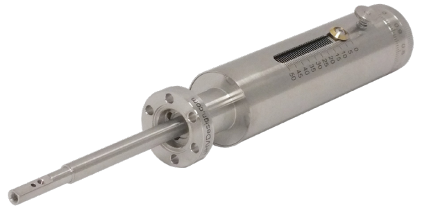
Linear Bellows Drive with micrometer scale

Bellows-sealed, precise lead-screw driven linear motion solutions for low load applications in ultra-high vacuum. Available in CF16 and CF35 flange sizes with stroke length options from 25mm to 150mm.