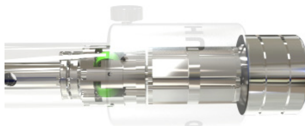
XDAPP40 uses rolling metal bearings shown in green to minimise pressure rise during translation.