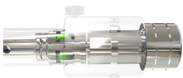
XEPP40 uses rolling metal bearings shown in green to minimise pressure rise during translation.