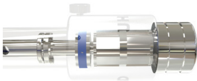
Standard EPP40 uses PEEK sliding bearings shown in blue.