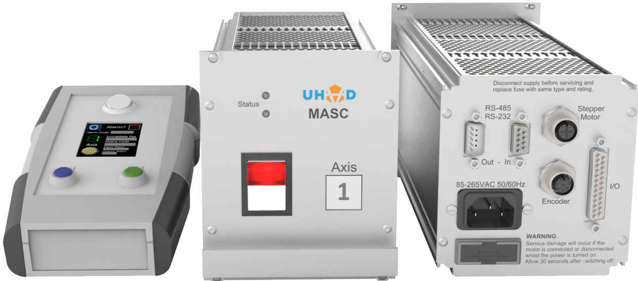
Jog Box with touchscreen